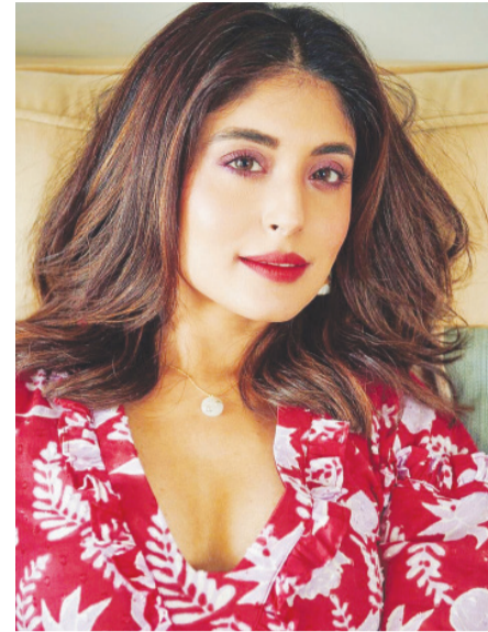
Actress Kritika Kamra takes centre-stage as she steps into the gritty world of gangsters in the upcoming series

Bambai Meri Jaan . The show has been produced by Excel Entertainment and created by director Shujaat Saudagar.