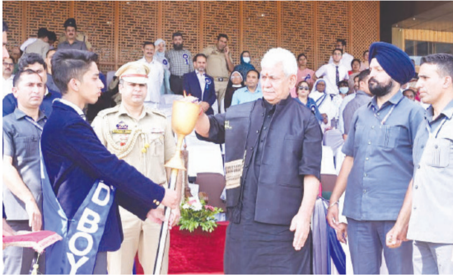
"We have to create a robust sports and fitness culture and make sports a

He impressed upon the teachers and parents to encourage sports and outdoor activities among the children for their overall well-being and all-round development.