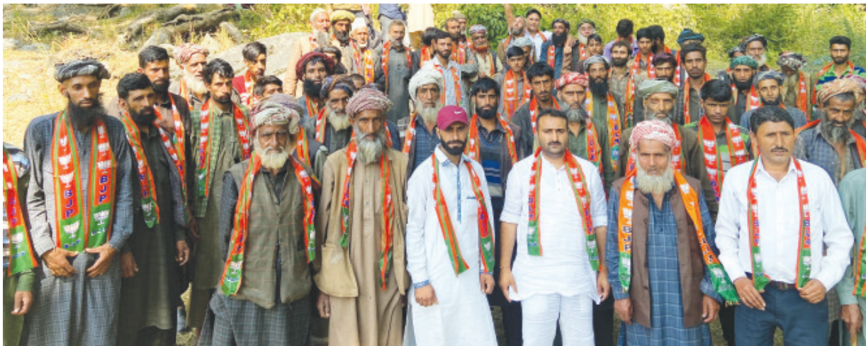
local parties NC, DPAP and PDP.

He said that like people of the country, people of Jammu and Kashmir are also fed up with Congress and