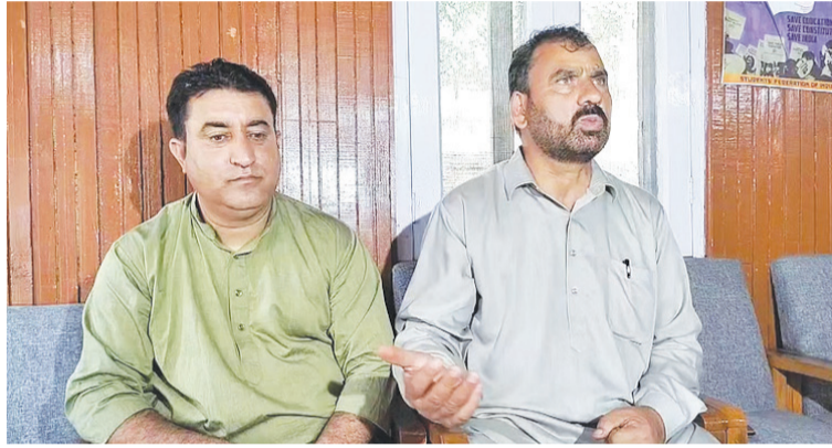
and submitted the memorandum.