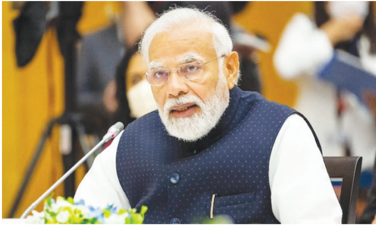
President Emmanuel Macron, sources said. The prime minister will also have a pull-aside meeting with his Canadian counterpart Justin Trudeau.

On Sunday, he will hold a working lunch meeting with French