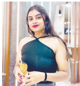
heri. She hailed from Chhattisgarh and came to Mumbai in April for training with a leading private airline.