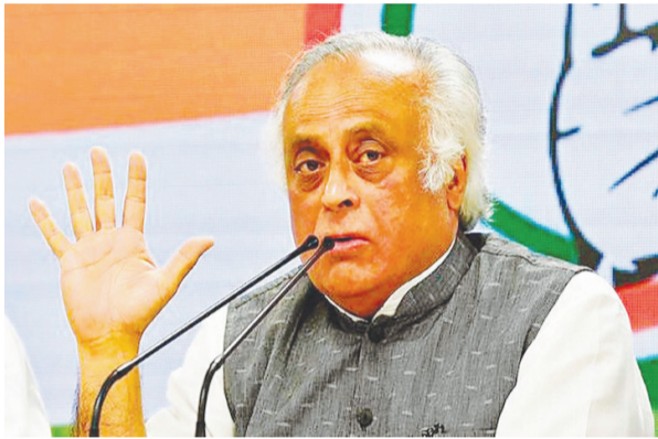
expenditure since 2011-12. The NSS revealed the truth of the Modi government's destruction of the economy thanks to demonetisation and a badly designed GST. So it has now been junked, Ramesh said.

The National Sample Survey (NSS) was conducted in 2017-18 but suppressed by the Modi government. The NSS unemployment data was not released until after the 2019 elections; the consumption data is yet to be made public. Leaks of the NSS showed a 45-year high in unemployment and an unprecedented decline in rural consumption