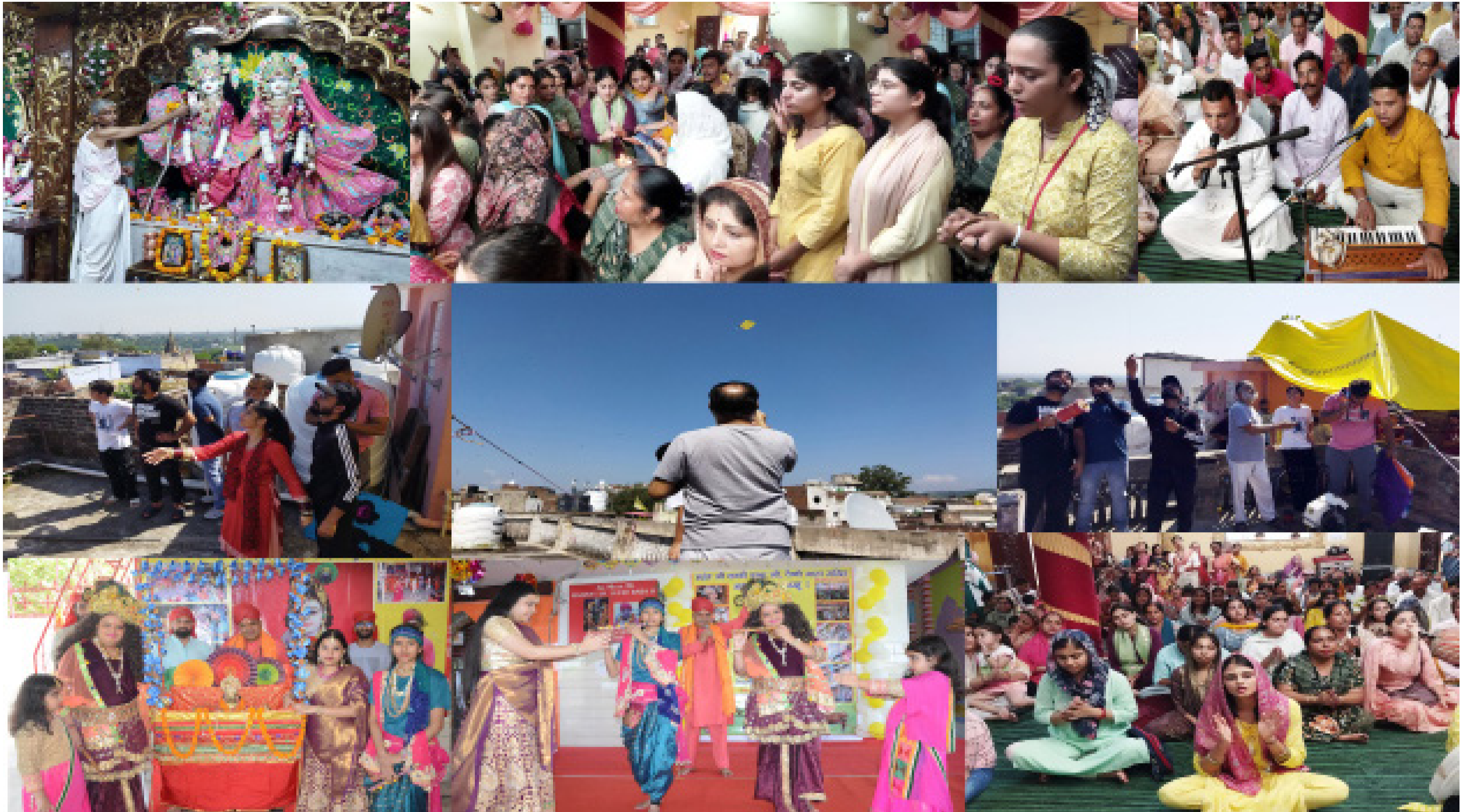
Glimpses of Shri Krishna Janmashtami celebrations in Jammu.