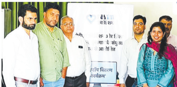
TOP NEWS REPORT

JAMMU, Sep 7: One97 Communications Limited that owns the brand Paytm, India's leading payments and financial services company and the pioneer of QR and mobile payments, along with Paytm Foundation has distributed 30 desktop computers to the district administration in Kulgam.