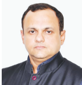
can demean Bharat title just to satiate petty political interests. Dr Parneesh said

made by the opposition parties to use Bharat as the title of the country instead of India. He said that the constitutional validity of word Bharat is in no way lesser than word India as both have equal significance in the law book of the country and people raising objections over substituting word Bharat instead of India are at fault because no one