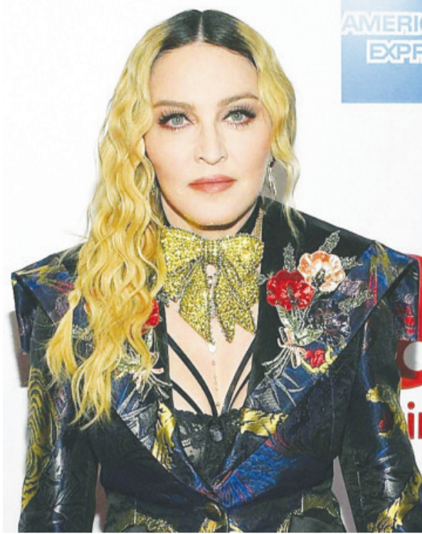
Veteran pop star Madonna has revealed she is back to rehearsals for her Celebrations

Tour, just months after she was rushed to an intensive care unit after being found unconscious. The Queen of Pop was forced to reschedule her world tour after her worrying hospital dash. She was intubated for at least one night back in June after suffering a "serious bacterial infection".