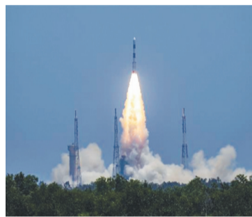
125 days to reach the Halo orbit around the Lagrangian Point L1, which is considered closest to the sun.

125 days of long journey to the sun,” she said. Union Minister Singh described today's achievement as a “sunshine moment,” and thanked Prime Minister Narendra Modi for the support to the space sector. The sun is a giant sphere of gas and Aditya-L1 would study its outer atmosphere. Aditya-L1 will neither land on the sun nor approach it any closer, ISRO said. It is expected to travel for about