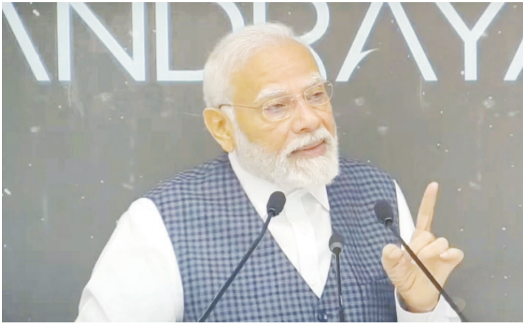
ISRO on Saturday launched the country's ambitious solar mission Aditya-L1, eyeing history again after its successful lunar expedition, Chandrayaan 3, a few days ago.

NEW DELHI, Sep 2 (Agencies): India's latest mission in its ambitious space programme blasted off today, a week after the country's successful unmanned Moon landing. Congratulating the scientists of Indian Space Research Organisation (ISRO), Prime Minister Narendra Modi said that the tireless efforts to better understand the Universe would continue. “Our tireless scientific efforts will continue in order to develop better understanding of the Universe for the welfare of entire humanity,” Prime Minister Narendra Modi tweeted.