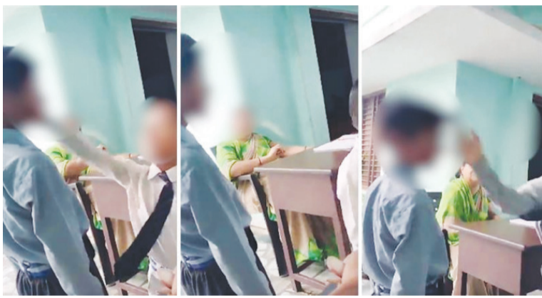
student slapped by classmates, she was forced to do it as she is handicapped and was not able to stand up and reach the student who had not done his assignment.

She, however, said though it was wrong on her part to get a