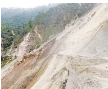
SHILLONG, Aug 26 (Agencies): A mudslide caused by incessant rainfall blocked the Sonapur tunnel on NH 6 in Meghalaya's East Jaintia Hills district

on Saturday blocking traffic movement to Tripura, Mizoram and Assam's Barak valley, police said.