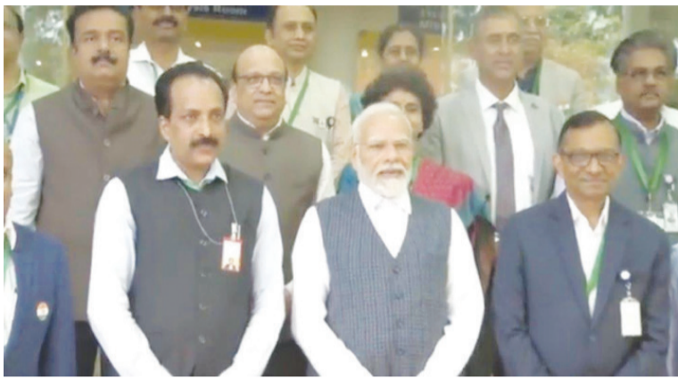
Modi addressed a gathering outside the HAL Airport. "The site on the moon where

Before heading for the ISRO Telemetry Tracking and Command Network (ISTRAC) here,