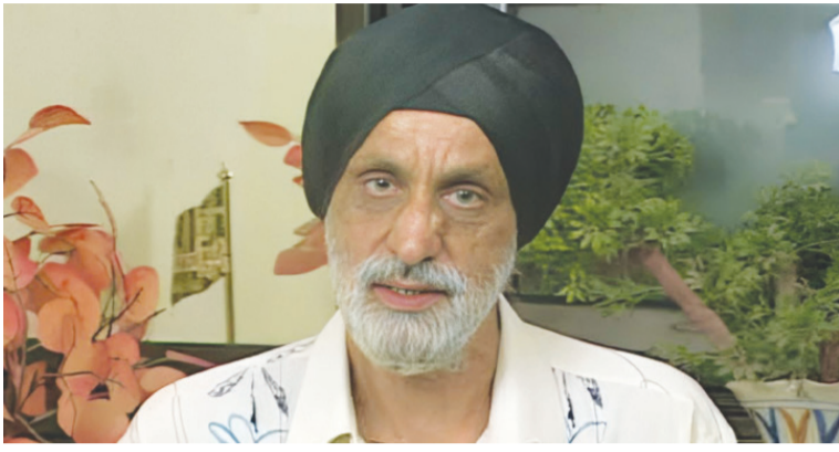
Born into a Sikh family in Rawalpindi (now Pakistan) on November 2, 1942, Kohli

Kohli's body will be kept for people and his fans to pay their last respects at his home in Lokhandwala Complex till 2 pm.