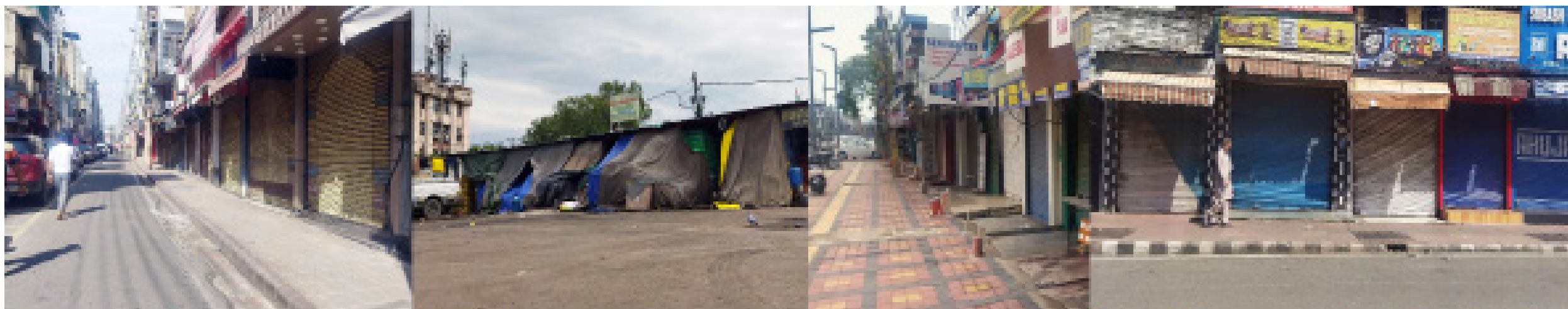
Shutdown of markets, protests and rallies define Successful Bandh in Jammu on Saturday.