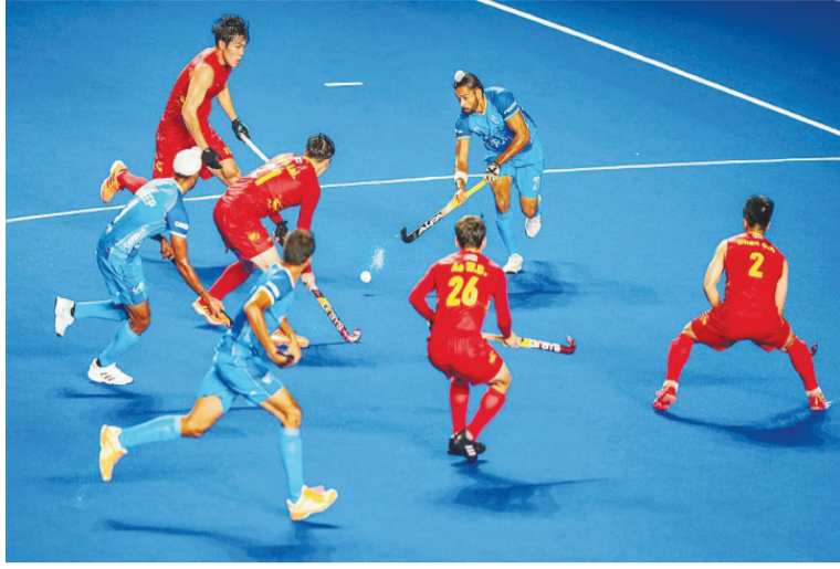
world No. 25 China.

Apart from skipper Harmanpreet (5th and 8th minutes) and Varun (19th and 30th), the other scorers for India were Sukhjjet Singh (15th), Akashdeep Singh (16th) and Mandeep Singh (40th). Interestingly, all the scorers for the hosts hail from Punjab. E Wenhui (18th) and Gao Jiasheng (25th) scored for