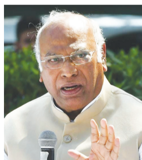
12.2 Lakh Formal Jobs in past 5 years! That means an average of JUST 24,400 Jobs per year!" he said in a tweet. "We are not inventing this figure. It is the

Modi government which created this narrative that EPF Regular Contributors = Creation of Formal Jobs! The EPF data corroborates this," Kharge said.