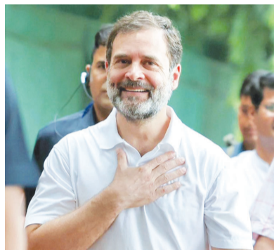
adjudication," the bench said. Purnesh Modi, a former minister in the Gujarat government, had filed a criminal defamation case in 2019 against Gandhi over his "How

"No reason has been given by the trial judge for imposing maximum sentence, the order of conviction needs to be stayed pending final