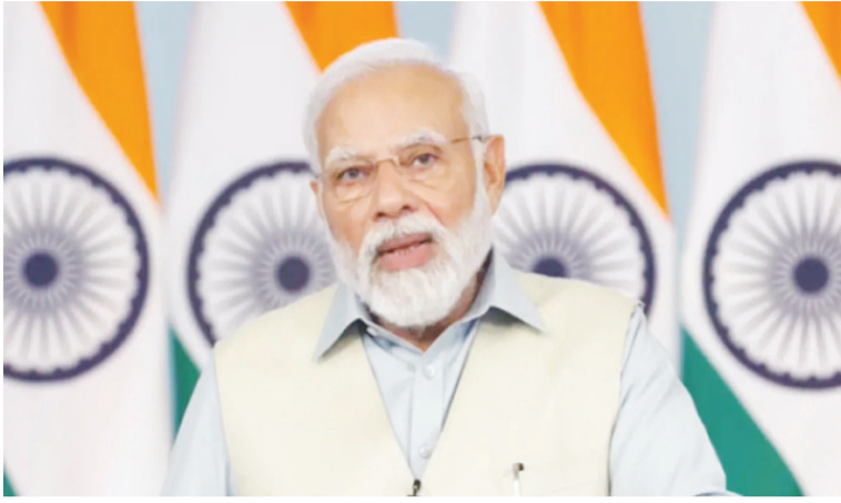
In another tweet in Hindi, he said, "Salutations to Lokmanya Tilak, the immortal fighter

"Salutations to the great son of the country, Chandrashekhar Azad, on his birth anniversary. The story of his sacrifice to protect the motherland will always inspire the people of the country," PM Modi said in a tweet in Hindi.