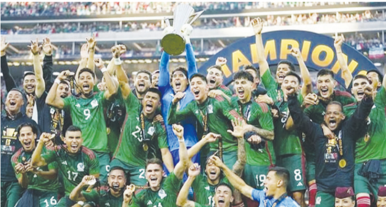
group stage of the World Cup for the first time since 1978, El Tri rebounded with an excellent tournament under interim coach Jaime Lozano, who took over the beleaguered program only a month ago after a Nations League loss to the U.S.

The goal by the Argentina-born Giménez, who came on only three minutes earlier, set off a frenzied celebration at a Southern California stadium packed with fans celebrating Mexico's revival in this biennial CONCACAF tournament. After Mexico was eliminated in the