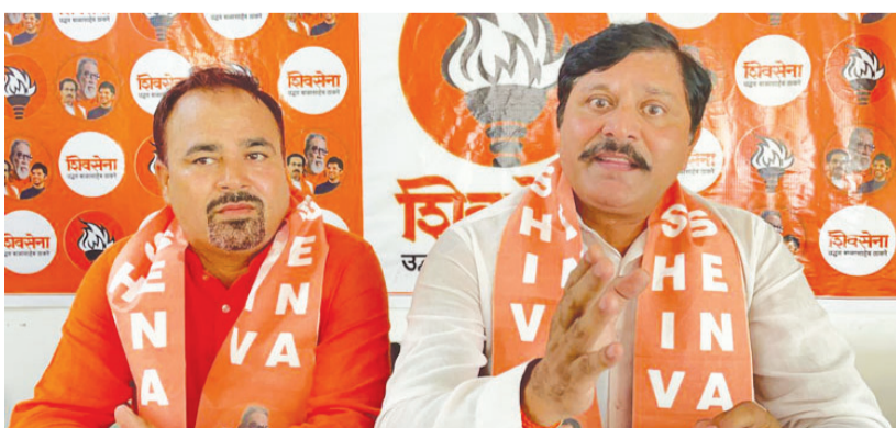
talks with the Pakistan government to ensure the safety of Hindus and