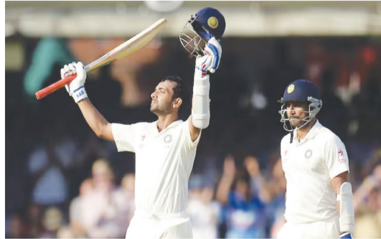
of the series, joined Rahane to rebuild the innings.

However, the team soon found itself in a precarious position with a score of 145-7, with the onus being on Rahane to guide the team to safety. Bhuvneshwar Kumar, who had previously scored two half-centuries batting at No. 9 in the first match