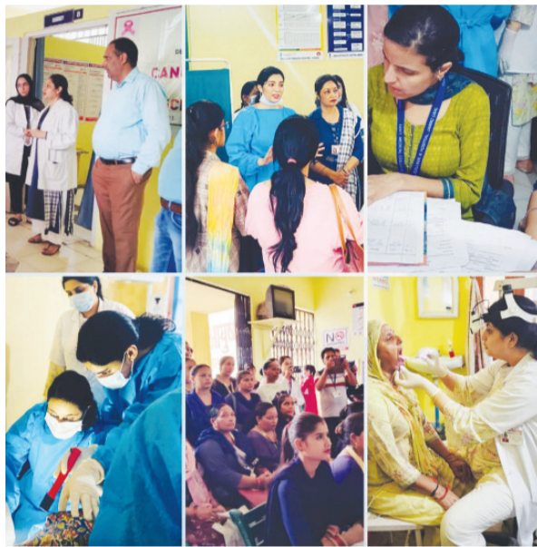
to the healthcare workers to equip them with the necessary skills to effectively screen for oral, Breast and Cervical cancer.

At these camps, along with the screening of the masses, healthcare facility assessment will also be done and comprehensive training shall be imparted