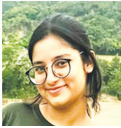
By: Kanka Pandita

Having quality healthcare facility at affordable cost is our fundamental right. But mostly we are unable to get this important service when needed, basically due to lack of less doctors in health sector and their proportionate presence all across the country.