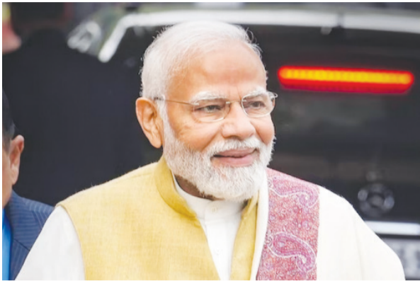
observed to commemorate the spirit of sacrifice and devotion to the Almighty.