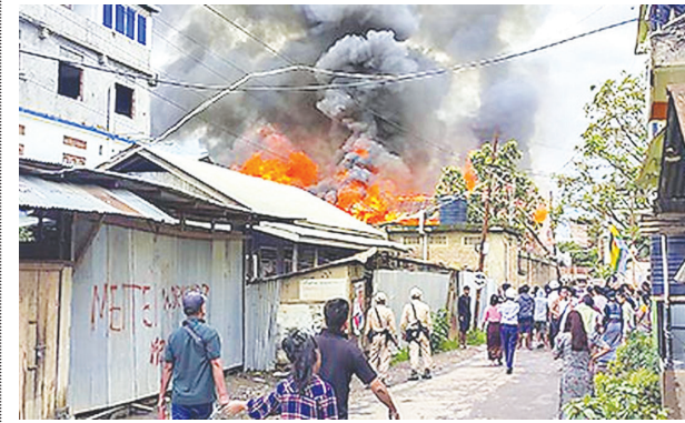
IMPHAL, Jun 16 (Agencies): Union Minister of State for External Affairs R.K. Ranjan