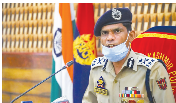
district of Kupwara on Thursday evening.

A police official said on specific information, joint parties of the army and police launched an operation in the Jumagund area of Line of Control (LoC) in the border