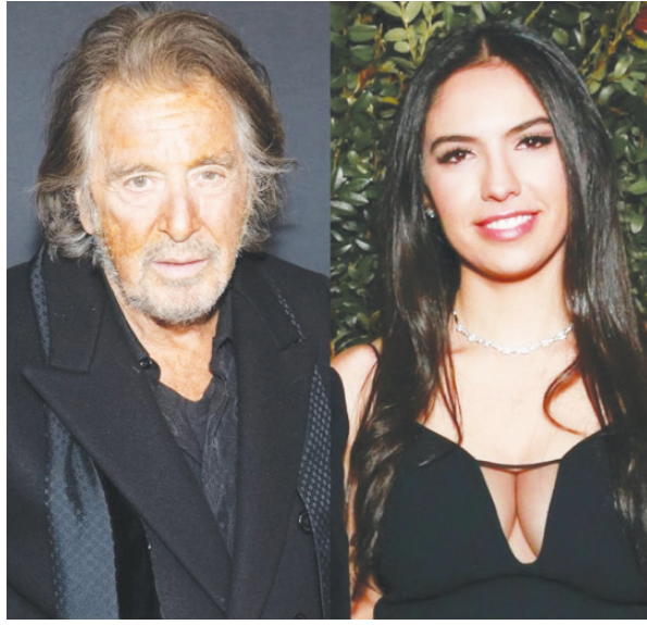
pandemic. "Pacino and Noor started seeing each other during the

According to Page Six, they had actually been quietly dating since the