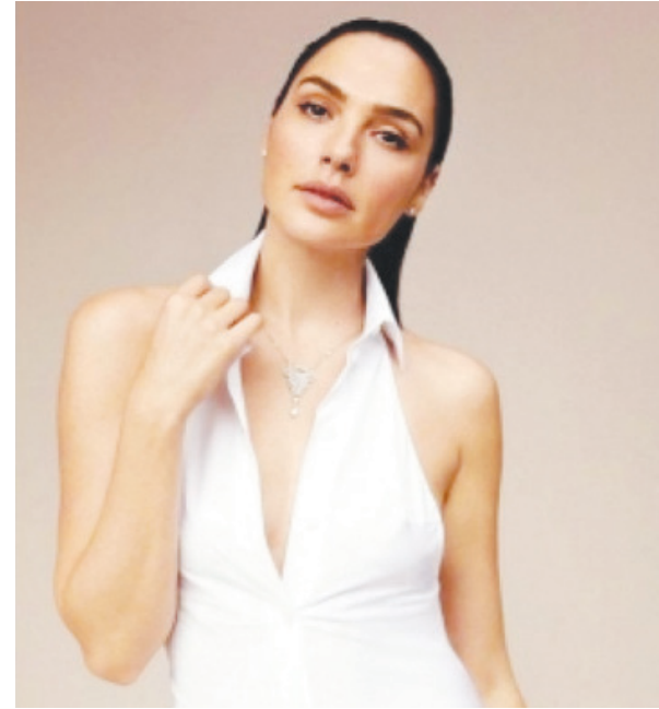
Gal Gadot shared that every time she acts, she

doubts herself and worries no one will like what