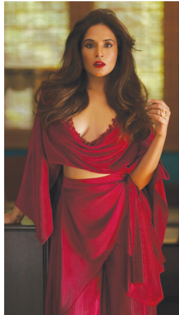
Richa Chadha's international debut with Indo-Brit production Ainaa has had its official

launch at the House of Lords in London. Richa takes on the lead role alongside British actor William Moseley.