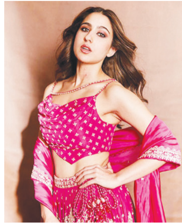
Actress Sara Ali Khan is super excited about her Cannes debut.

The 'Kedarnath' star is currently in Cannes to attend the 76th edition of the prestigious film festival.