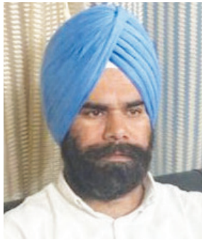
Minority Community in J&K.

The Union Government decision on deliberately ignoring of Punjabi language and this act of the government had created strong resentment among the