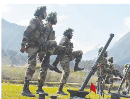
Army's character to be a fair and equitable organisation," it said.

"In order to promote and strengthen common identity and approach in service matters amongst senior leadership, beyond the boundaries of regimentation, the Indian Army has decided to adopt a common uniform for brigadier and above rank officers," said a source. "This will also reinforce the Indian