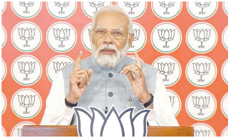
we come together and set our minds to a goal, no force in the world can stop us," he said on Twitter.

He also sought their blessings in the mission to make the state the number one in the country. "Dream of every citizen of Karnataka is my dream. Your resolve is my resolve. When