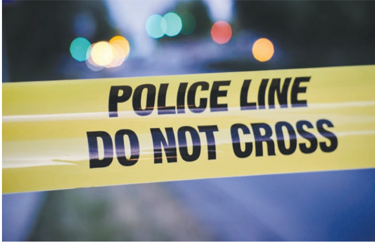
A short circuit in a part of the mine about 100 metres below the surface. Relatives of the victims were brought by buses to the mine in Yanaquihua in the Arequipa region, where they were briefed by security agents. Some sat in

LIMA, May 8 (Agencies): A fire broke out deep in a gold mine in southern Peru and killed at least 27 workers during an overnight shift, Peruvian authorities reported. The Yanaquihua mining company said in a statement that a total of 175 workers had been safely evacuated after the accident, which happened late Friday or early Saturday. It said the 27 dead worked for a contractor that specializes in mining. Government officials said the cause of the incident was under investigation. Some news reports said preliminary investigations indicated an explosion might have been set off by