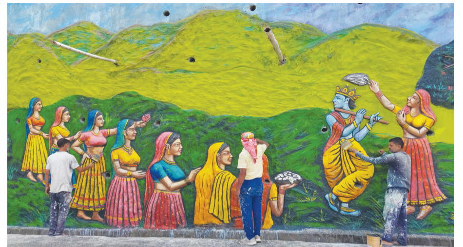
Colourful Basohli Art paintings on walls at Bahu Fort Ropeway Station in Jammu making more attractive to tourists.