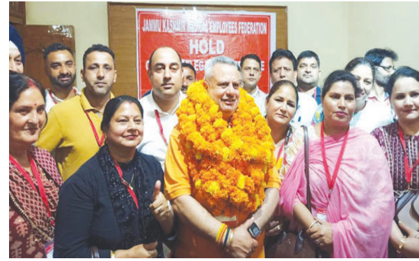
TOP NEWS REPORT

JAMMU, May 7: Jammu Kashmir Medical Employees Federation (JKMEF) organized one-day delegates conference at Press Club Jammu on 7may 2023 to create awareness mong delegates to strengthen the federation for overall changing scenario and plan future strategies of federation to achieve goals