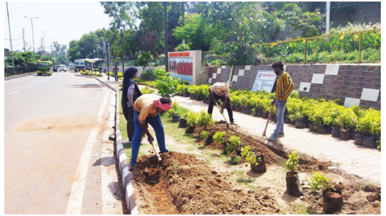
MAKING JAMMU SMART: Saplings being planted on pathways under the prestigious smart city project at Bus Stand Jammu.

In the end, the delegation thanked the Relief & Rehabilitation Commissioner for taking personal interest in redressing the issues faced by the Kashmiri displaced community.